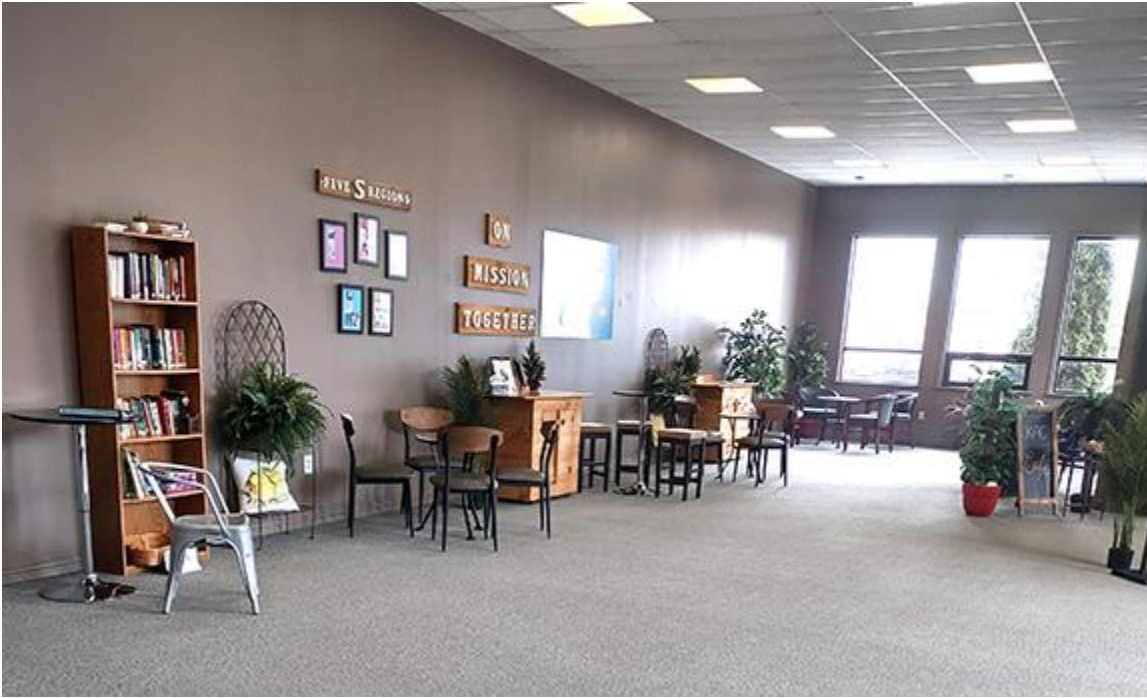
Lower Foyer (Entrance)